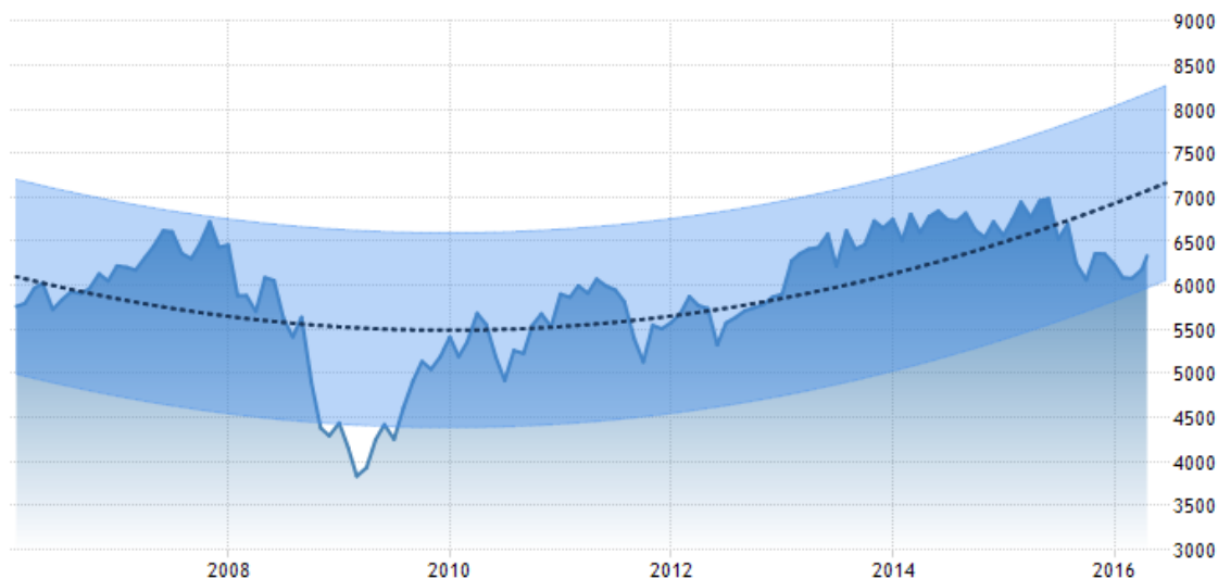
UK FTSE 100 STOCK MARKET INDEX