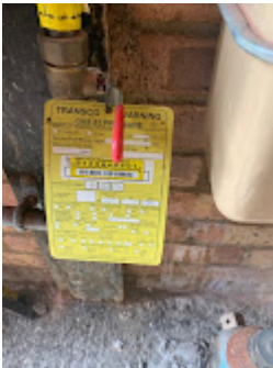
2nd Floor Gas a.jpg 105K