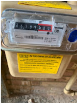
2nd floor Gas.jpg 94K