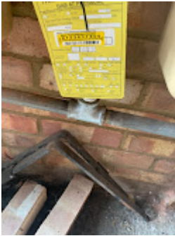
1st Floor Gas a.jpg 105K