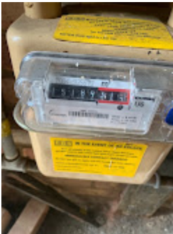
1st Floor Gas.jpg 95K