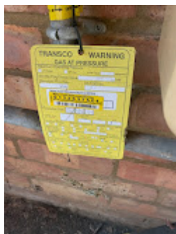
GF Gas a.jpg 101K