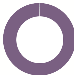
Asset Class Breakdown