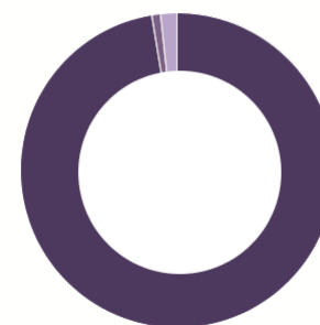
Equities Regional Breakdown

■ UK, 97% ■ Rest of the World, 1% ■ North America, 2%