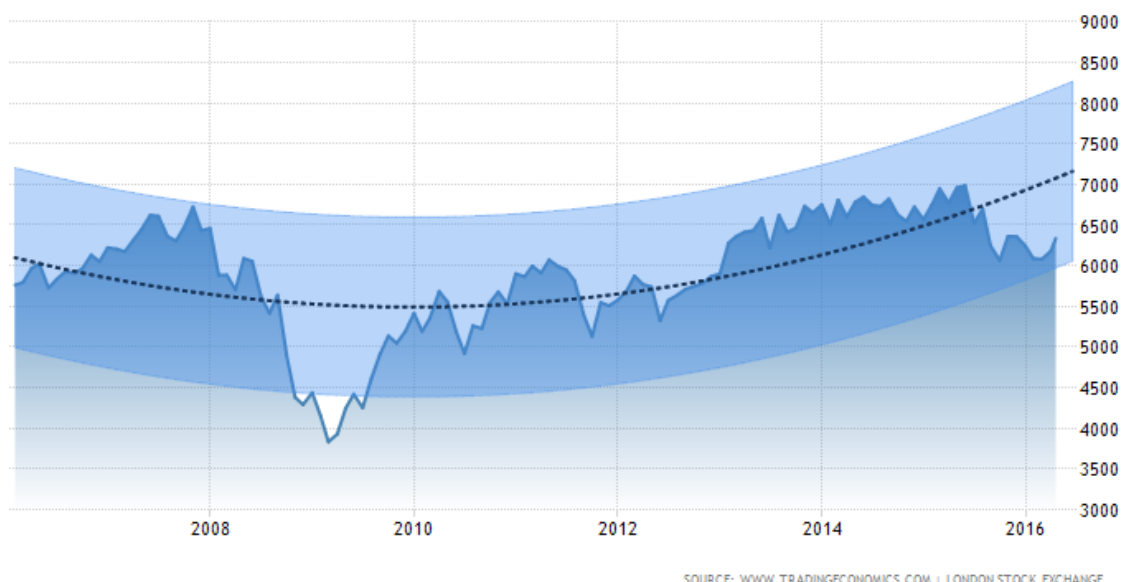
UK FTSE 100 STOCK MARKET INDEX

The UK FTSE 100 Stock Market Index is expected to trade at 6000.00 points by the end of this quarter, according to Trading Economics global macro models and analysts expectations. Looking forward, we estimate it to trade at 5510.00 in 12 months time.