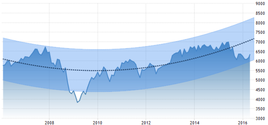
UK FTSE 100 STOCK MARKET INDEX